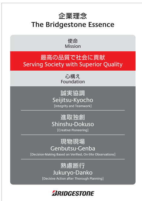
The Bridgestone Essence (Corporate Philosophy) https://www.bridgestone.com/corporate/philosophy/

Company Code: "Serving Society with Superior Quality" Shojiro Ishibashi