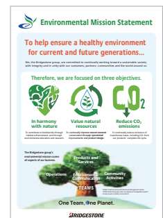
Environmental Mission Statement www.bridgestone.com/responsibilities/environment/vision/index.html