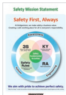
Safety Mission Statement www.bridgestone.com/responsibilities/social/safety_health/index.html