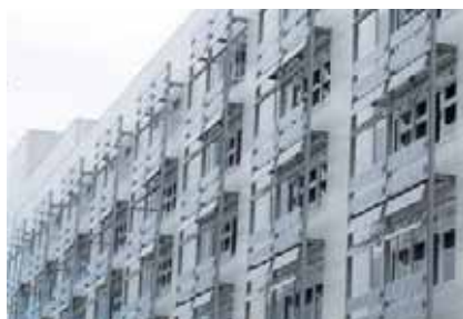
A New Testing and Development Center in Yokohama Plant: This facility focuses on experimental performance tests in the development of chemical and industrial products.