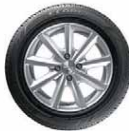
ECOPIA EP25: ECOPIA EP25 employs a compound that applies NanoPro-Tech, Bridgestone’s proprietary materials technology.