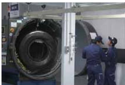
Bandag Retread Factory: To promote Eco Value Pack, Bridgestone plans to open about 20 Bandag Retread Factory locations in Japan over the next few years.

In electronic paper, meanwhile, we plan to make further progress in verification testing of electronic shelf tags and to commence full-scale commercialization initiatives beginning in 2009. A key characteristic of electronic paper is that it does not require electrical power to maintain an image, so in addition to reducing resource consumption when used in place of paper, it also contributes to energy savings. Moving forward, we will take steps to cultivate demand for this promising product.