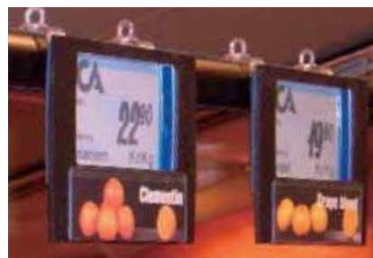
Electronic Shelf Tags: Our electronic paper display modules can read bar codes and QR codes, and they can display a wide range of information.